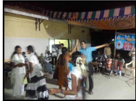
Lines Club President & Team Members Helpage CE , dancing with our resident and Joined Given 72000/- cheque adopt amake them happy on the occasion of NEW Elderly /Village concept to CE of HelpAge YEAR. india.